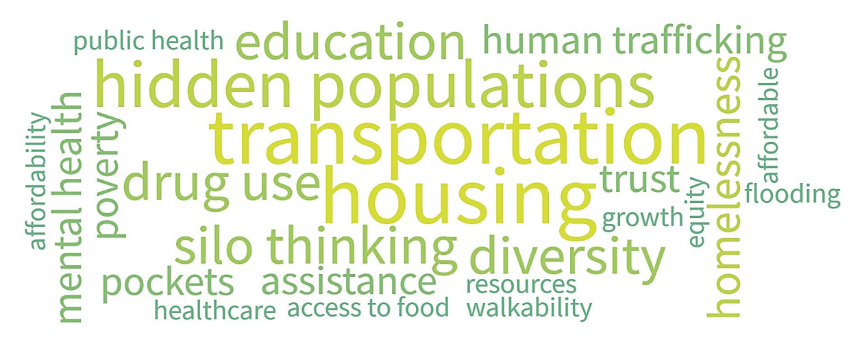
Focus Group Response

Fort Bend has both urban and rural areas, making it "hard for people who live in the rural community to be involved in the day-to-day activities in the more urban parts of town." Balancing different lifestyles and landscapes poses difficulty due to varying needs and issues across the community. "[There is] very limited public transportation, but it's hard to justify putting public transport in rural areas. There tend to be homeowners with deep roots who don't want to live in apartments or in areas where they might be closer to resources, so how do you serve them?" People in the community want to help, but are challenged with such diversity.