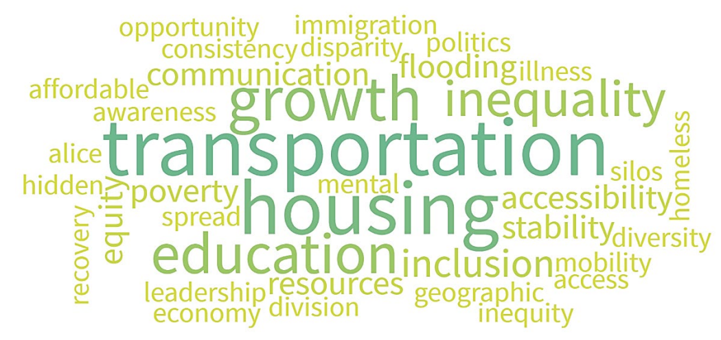
Real-Time Polling In one word, describe a pressing <u>challenge</u> in your community.

Many respondents emphasized that Fort Bend is one of the fastest growing and most diverse counties, which comes with many challenges. "[With] growth and diversity, it still seems like a very close knit community, which can be helpful as well as cause problems." Many participants posed the same question - "How [do we] allow it to grow and still keep its roots?"